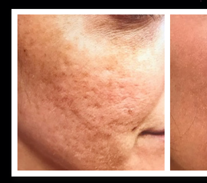
HALO® | 3 MONTHS POST 2 TREATMENTS