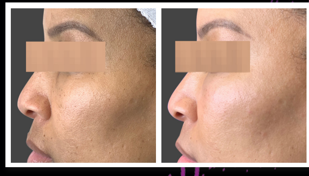
HALO® | 2 WEEKS POST 1 TREATMENT