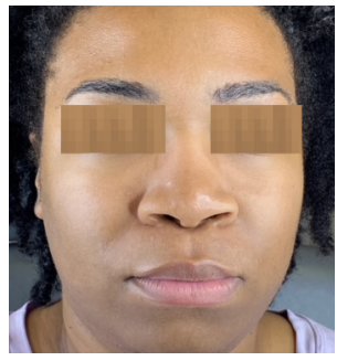
HALO® | 4 WEEKS POST 1 TREATMENT