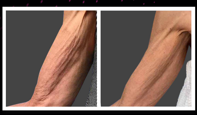
HALO® | 3 MONTHS POST 1 TREATMENT