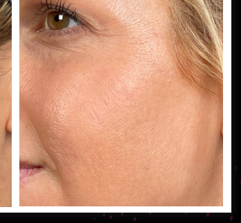
HALO® | 6 WEEKS POST 1 TREATMENT